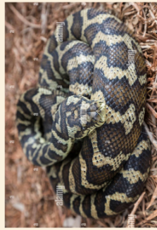
Coastal Carpet Python