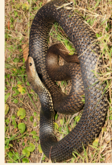
Eastern Brown Snake