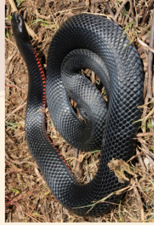
Red Belly Black Snake